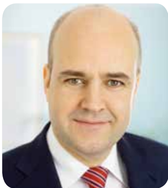
Fredrik Reinfeldt Prime Minister

The starting point for the 2013 Presidency will be the Nordic social model, which has already made a successful contribution to our nations' growth, welfare and solidarity. With this model behind us, we believe that the time is ripe to take Nordic co-operation a step further and face the challenges of the future together.